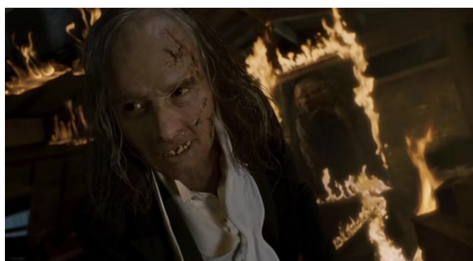
The final scene of the film

During Lord Wotton's party Emily goes to Dorian's house to find and destroy the picture, but he is stopped by the same Dorian who decides to die by setting fire to drawing of him to rescue Emily and Harry.