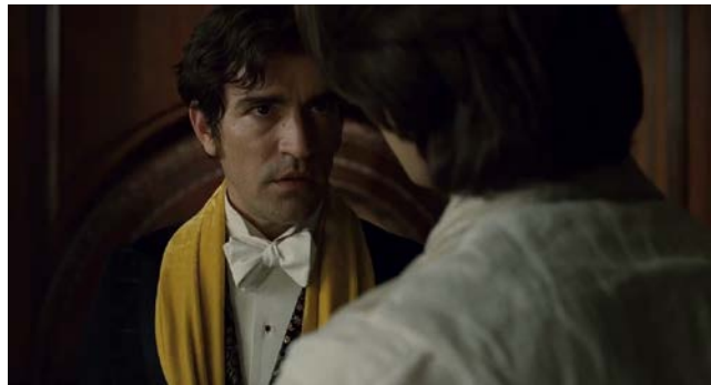
Basil (Ben Chaplin) in a scene from the film

When he returns to London 25 years later without any change in his young look, he meets Lord Wotton and his daughter, Emily, who fall in love with Dorian. He begins to understand the gravity of his actions and he goes to the cemetery where Sibyl was buried. Meanwhile, Emily's father contrasts their relationship because he is convinced that Dorian is the victim of a strange curse. In fact, his picture has taken the old Dorian making him stay forever young.